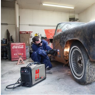
Home Garage Use