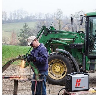
On the Farm