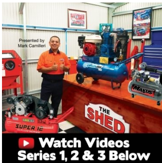
Intro, Selecting & Installing Compressors