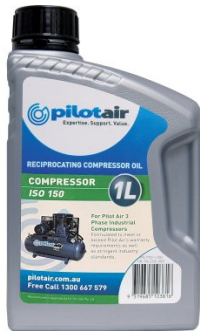
C347 ISO 150 Air Compressor Oil