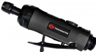
A040 Air Die Grinder