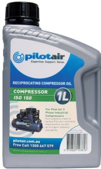
C347 ISO 150 Air Compressor Oil