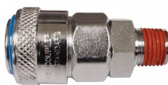
F945 High-Flow One Touch System Air Fittings