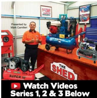
Intro, Selecting & Installing Compressors