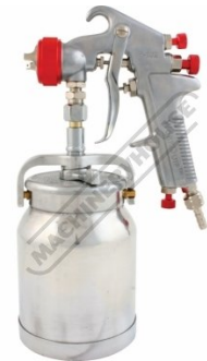
S325 Suction Spray Gun & Pot