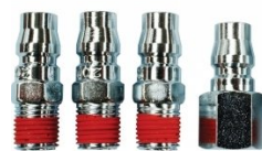
F935 High-Flow Air Fittings