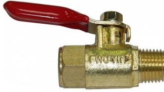
F930 Air Fittings