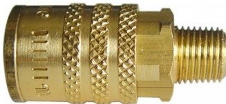
F901 Air Fittings