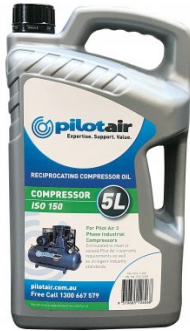
C346 ISO 150 Air Compressor Oil