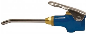
S440 Air Blow Gun