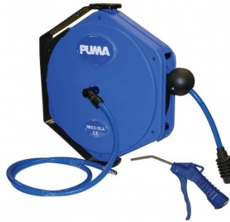
H040 Industrial Retractable Air Hose Reel