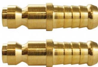
F906A Air Fittings