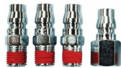
F935 High-Flow Air Fittings