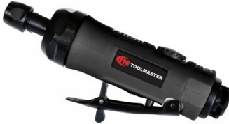
A040 Air Die Grinder