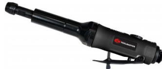
A041 Air Die Grinder - Extended Shaft 5" (127mm)