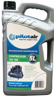
C346 ISO 150 Air Compressor Oil