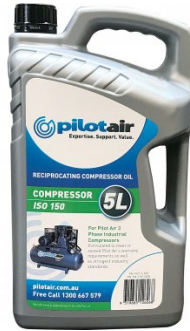
C346 ISO 150 Air Compressor Oil