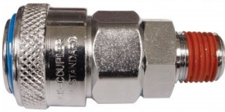
F945 High-Flow One Touch System Air Fittings