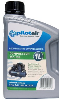
C347 ISO 150 Air Compressor Oil