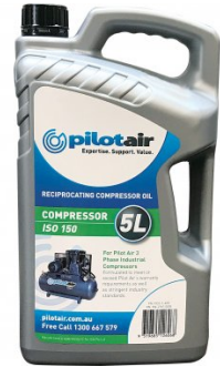
C346 ISO 150 Air Compressor Oil