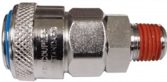
F941 High-Flow One Touch System Air Fittings