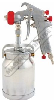
S325 Suction Spray Gun & Pot