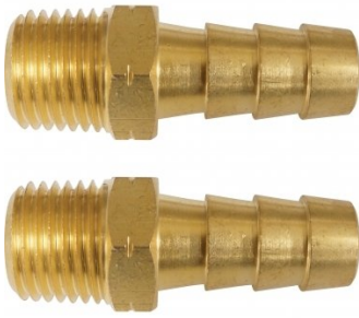
F803 Air Fittings