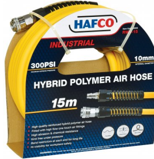
H008 Industrial Polymer Air Hose