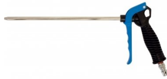
A251 Hi Flow Air Duster Gun