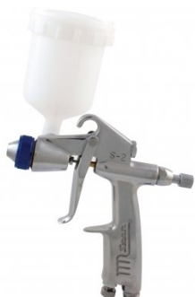
S322 Gravity Feed - Spray Gun