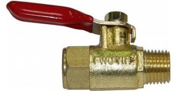
F930 Air Fittings