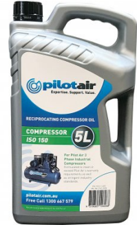
C346 ISO 150 Air Compressor Oil