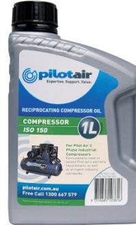
C347 ISO 150 Air Compressor Oil