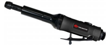
A041 Air Die Grinder - Extended Shaft 5" (127mm)