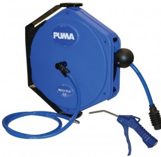
H045 Retractable Air Hose Reel - Includes Air Dusting gun