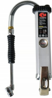
A264 Professional Tyre Inflator with Linear Gauge