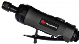
A040 Air Die Grinder