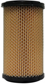
C3491A Filter Assembly