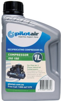
C347 ISO 150 Air Compressor Oil