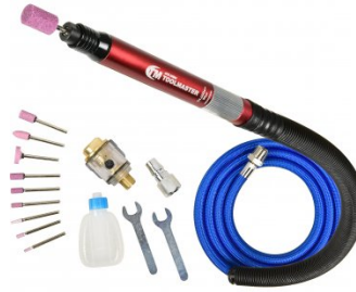
A043 Air Micro Die Grinder Kit