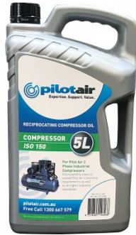
C346 ISO 150 Air Compressor Oil