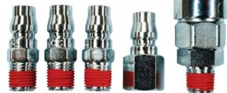
F935 High-Flow Air Fittings