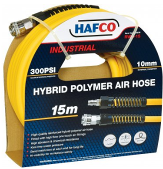
H008 Industrial Polymer Air Hose