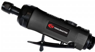
A040 Air Die Grinder