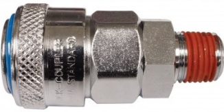
F945 High-Flow One Touch System Air Fittings