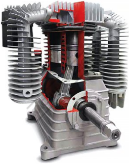
K Series Pump