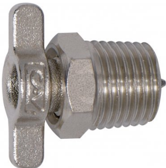
A242 Air Fittings