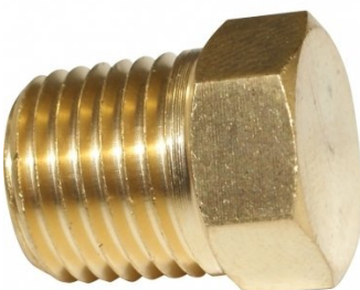
F870 Air Fittings