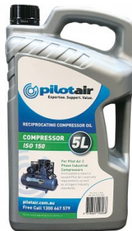
C346 ISO 150 Air Compressor Oil