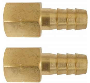
F811 Air Fittings