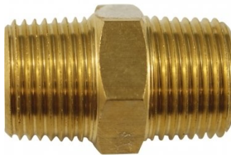
F864 Air Fittings