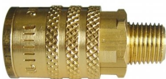
F901 Air Fittings