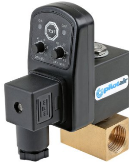
A195 Industrial Automatic Compressed Air Condensate Drain