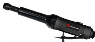
A041 Air Die Grinder - Extended Shaft 5" (127mm)