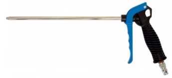
A251 Hi Flow Air Duster Gun