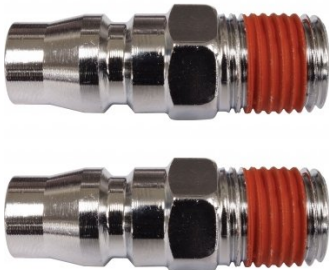
F951 High-Flow Air Fittings