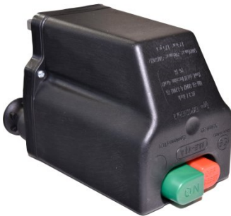
A228 Pressure Switch