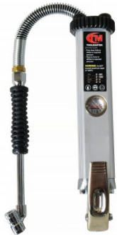
A264 Professional Tyre Inflator with Linear Gauge