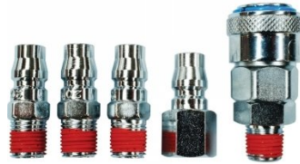
F935 High-Flow Air Fittings