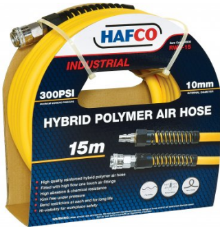
H008 Industrial Polymer Air Hose