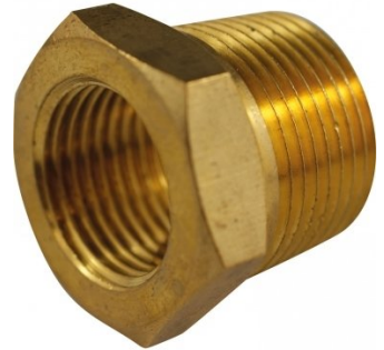
F842 Air Fittings