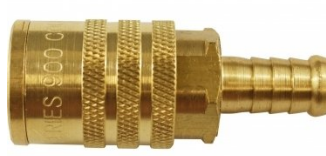
F912 Air Fittings