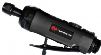
A040 Air Die Grinder