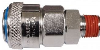
F945 High-Flow One Touch System Air Fittings