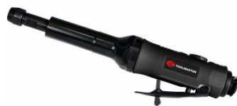
A041 Air Die Grinder - Extended Shaft 5" (127mm)