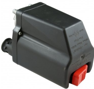
A227 Pressure Switch