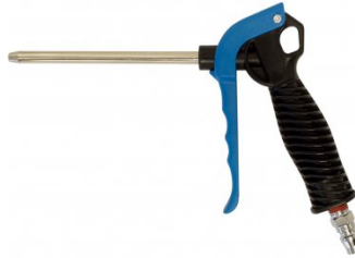
A251 Hi Flow Air Duster Gun