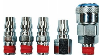
F935 High-Flow Air Fittings