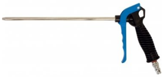
A251 Hi Flow Air Duster Gun