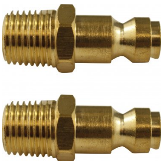
F902B Air Fittings