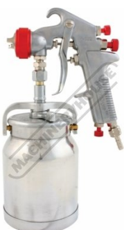
S325 Suction Spray Gun & Pot