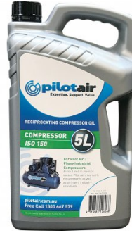
C346 ISO 150 Air Compressor Oil