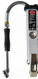
A264 Professional Tyre Inflator with Linear Gauge