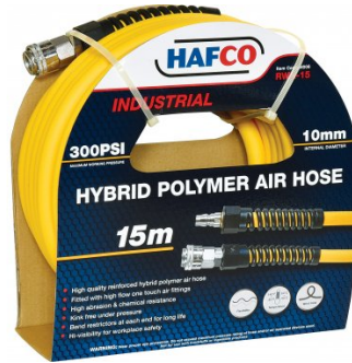
H008 Industrial Polymer Air Hose