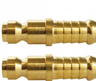
F906A Air Fittings