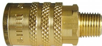
F901 Air Fittings