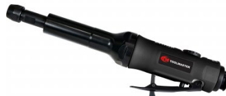
A041 Air Die Grinder - Extended Shaft 5" (127mm)