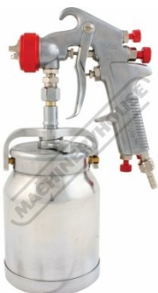
S325 Suction Spray Gun & Pot