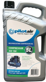
C346 ISO 150 Air Compressor Oil