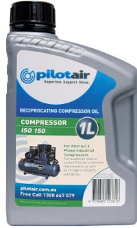
C347 ISO 150 Air Compressor Oil