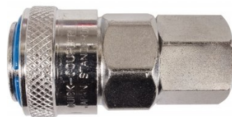
F940 High-Flow One Touch System Air Fittings