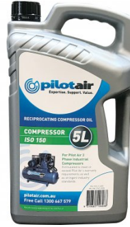
C346 ISO 150 Air Compressor Oil