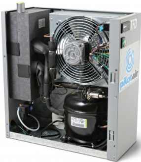
Side Case Open