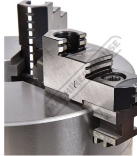
Jaw Rear View