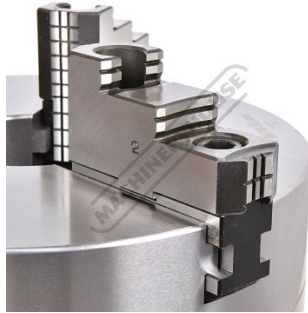
Jaw Rear View