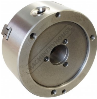
Back Plate Mount