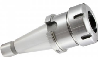
C110 Collet Chuck - NT30 x ER32