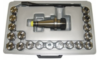
C929 Collet & Chuck Set - 20 Piece