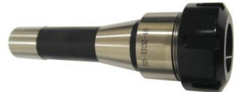
C106 Collet Chuck - R8 x ER32