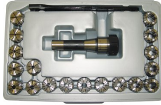
C927 Collet & Chuck Set - 20 Piece