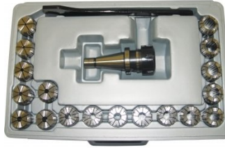
C928 Collet & Chuck Set - 20 Piece