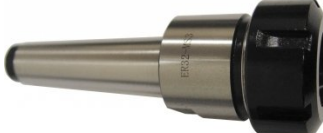
C106 Collet Chuck - R8 x ER32