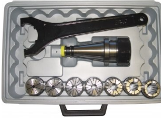
C962 Collet & Chuck Set - 9 Piece