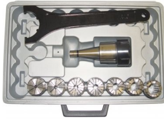
C961 Collet & Chuck Set - 9 Piece