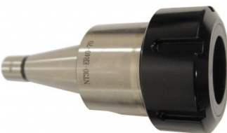
C111 Collet Chuck - NT30 x ER40