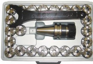
C967 Collet & Chuck Set - 25 Piece