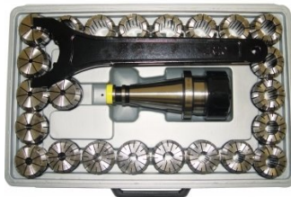
C966 Collet & Chuck Set - 25 Piece