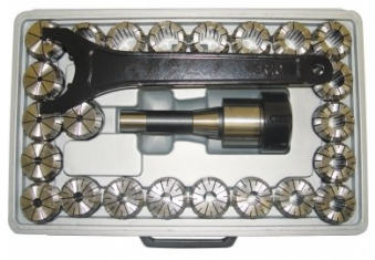
C964 Collet & Chuck Set - 25 Piece