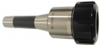
C138 Collet Chuck R8 x ER40