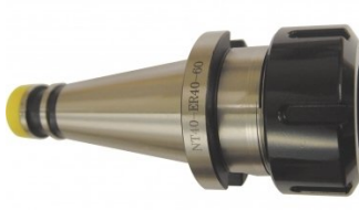
C114 Collet Chuck NT40 x ER40