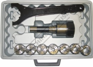
C960 Collet & Chuck Set - 9 Piece