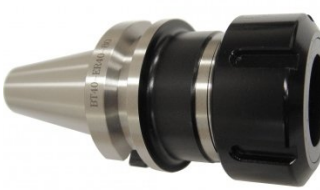
T226 BT40 x ER40-80 Collet Chuck