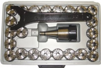
C965 Collet & Chuck Set - 25 Piece