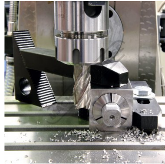
Shown Used with Square Holder