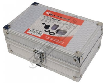
Aluminium Storage Case Closed