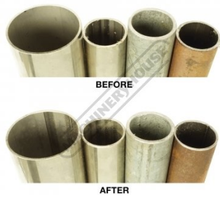
Material Before and After