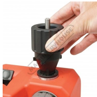
Facing the Back Angle Operation