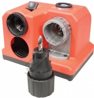
Shown with a Drill in the Chuck