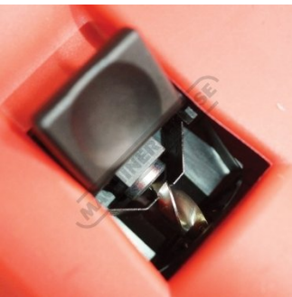
Setting the Drill