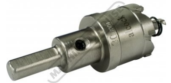
Rear View of Cutter