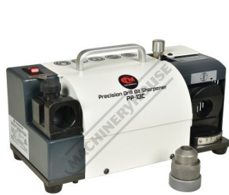
Shown with Drill Chuck