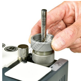
Grinding Split Point Station