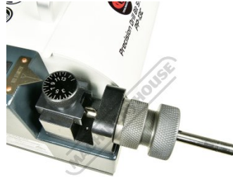
Drill Setting Gauge with 9mm Drill Bit