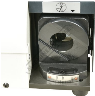
Drill Angle Setting at 90 Degrees