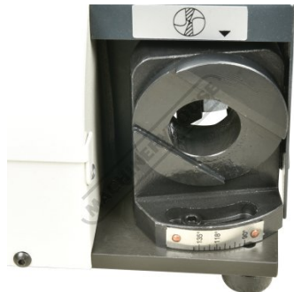
Drill Angle Setting at 90 Degrees