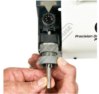
Setting Up 9mm Drill Bit