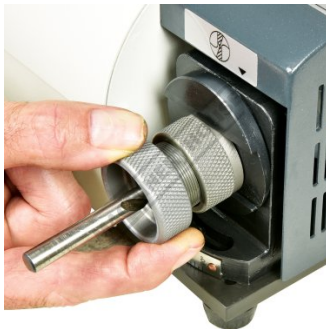
Sharpening Drill Bit Station 1