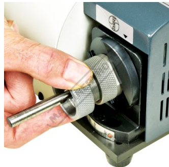
Sharpening Drill Bit Station 1