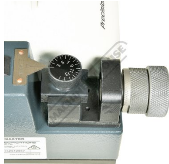
Drill Setting Gauge