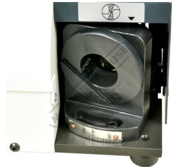
Drill Angle Setting at 90 Degrees