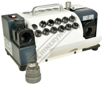
ER20 Collet Set Storage