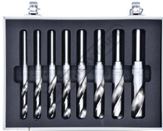
Case Top View