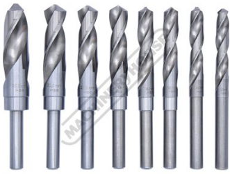
Metric Reduced Shank Drill Set