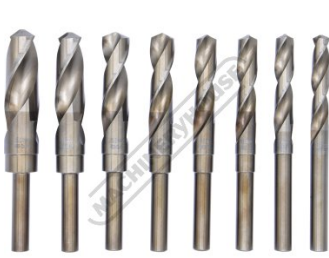
Metric Reduced Shank Drill Set