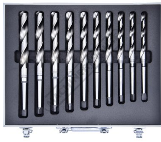
Case Top View