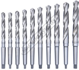
Metric 2MT HSS Drill Set