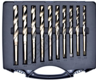
Case Open Top View