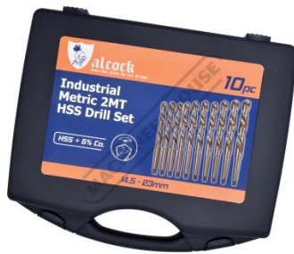
Case Top View