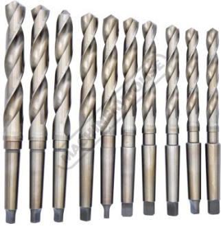
Drill Set Top View