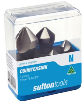
D106 Countersink Sets – 90° Three Flute