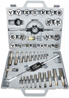
T015 Imperial Alloy Steel Tap & Die Set - 45 Piece