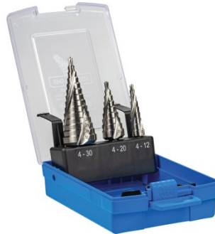
D107 HSS Step Drill Sets