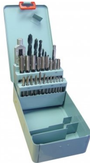
T019 Metric HSS Hand Tap & Drill Set - 29 Piece