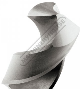
118 Degree Standard Point