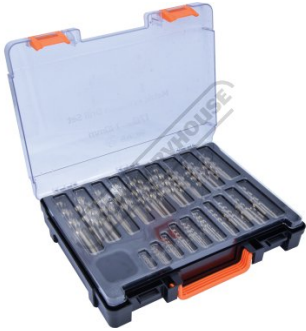
Lid Open with Plastic Cover