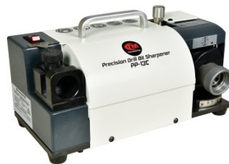
D111 Precision Drill Sharpener