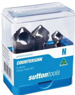
D105 Deburring Countersink Sets – 90° Cross Hole