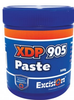
S074 Cutting Tool Lubricant Paste - 500g