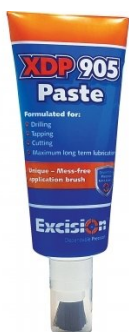
S075 Cutting Tool Lubricant Paste - 200g