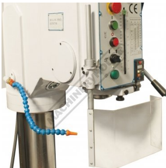
Chuck Guard with Micro Switch and Coolant Nozzle