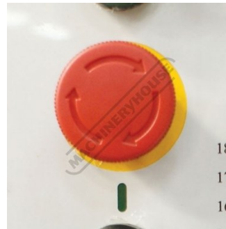
Emergency stop Switch and Overload Protection