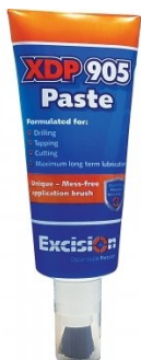
S075 Cutting Tool Lubricant Paste - 200g