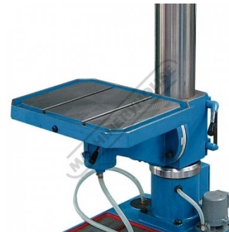
T Slotted Work Table