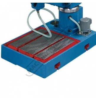
T Slotted Base