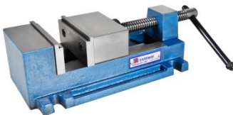
V141 Safeway Precision Drill Press Vice