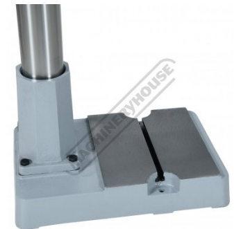
Heavy Duty Base With T Slot