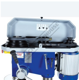
B Section Belt Drive System