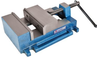
V143 Safeway Precision Drill Press Vice