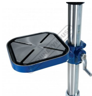
Table Rack Pinion Wind Up