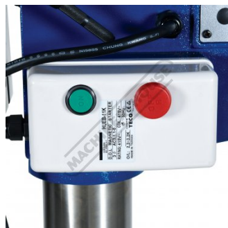
ON / OFF Power Switch