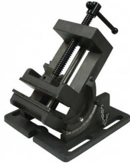
V114 Tilting Drill Press Vice