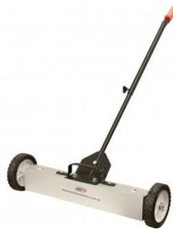
M9991 Magnetic Floor Sweeper