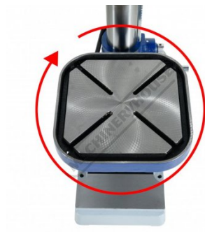
Cast Iron Table Rotates 360 Degree