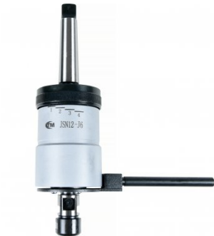
T004 Reversible Tapping Chuck - Adjustable Clutch