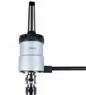
T005 Reversible Tapping Chuck - Adjustable Clutch