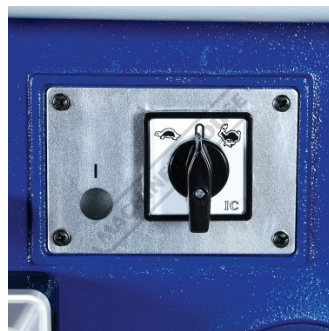
2 Speed Switch