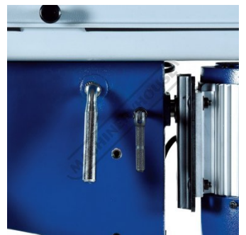
Belt Tension & Lock Lever