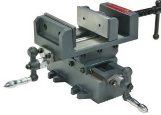
V1204 Compound Drill Vice