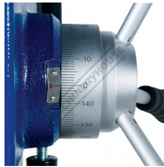
Drilling Depth Stop Setting With Scale