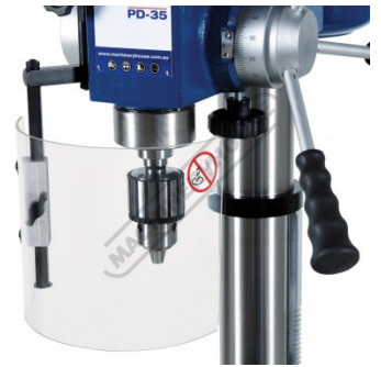
Drill Chuck Safety Guard With Micro Switch