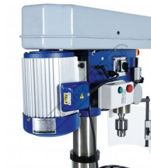
415V 1HP Motor