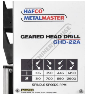
High/Low With Forward & Reverse & Spindle Speeds