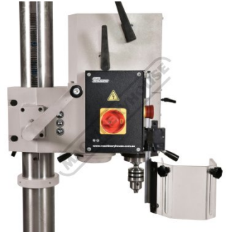
Rack & Pinion Wind Up Drill Head