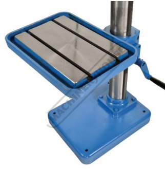
T Slotted Work Table With 360 Degree Rotation