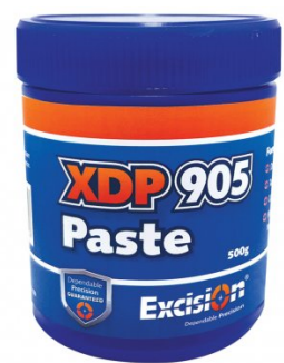
S074 Cutting Tool Lubricant Paste - 500g