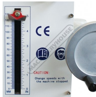
Adjustable Accurate Depth Setting For Increased Productivity