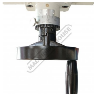
Table Cross Travel Handle