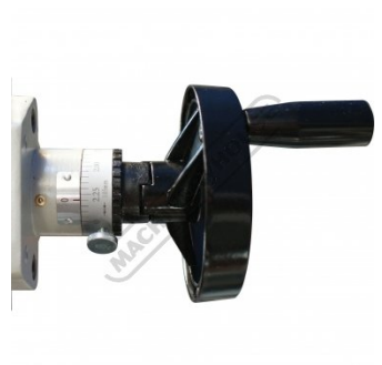
Table Longitudinal Travel Handle