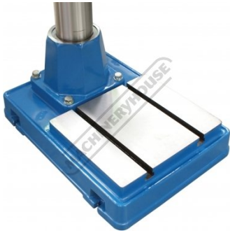
T Slotted Base