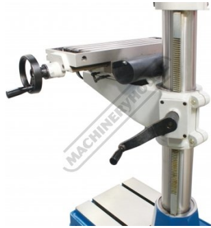
Rack and Pinion Wind Up Table