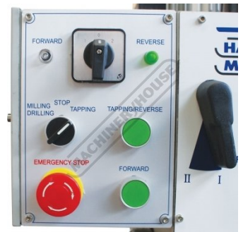
Emergency Stop Switch and Overload Protection and Tapping Function