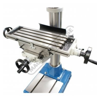
T Slotted Work Table