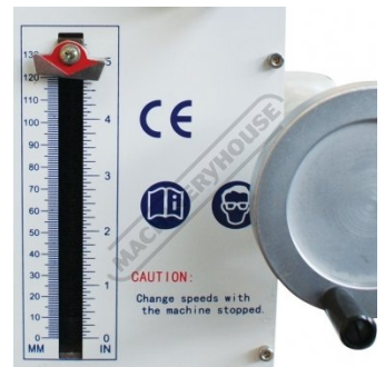
Adjustable Accurate Depth Setting For Increased Productivity