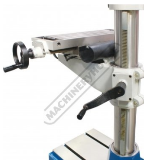
Rack and Pinion Wind Up Table