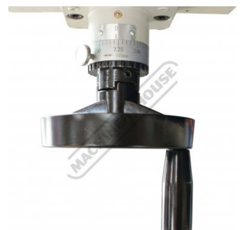
Table Cross Travel Handle