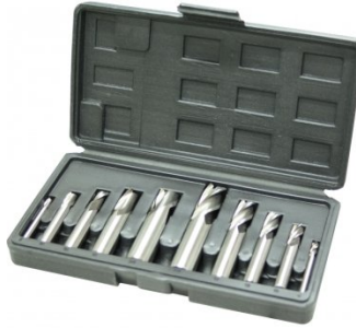
M3301 Metric HSS Slot Drill & End Mill Set - 10 Piece