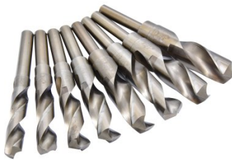
D1181 Imperial Industrial HSS Reduced Shank Drill Set