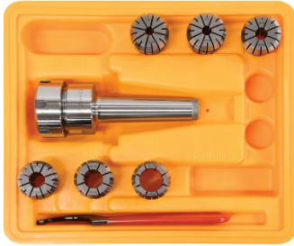
C922B Collet & Chuck Set - 8 Piece