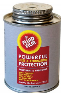
O043 Rust & Corrosion Preventive