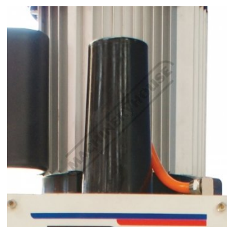
Drawbar for Milling