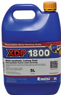
S090 Soluble Metal Cutting Fluid - 5 Litre