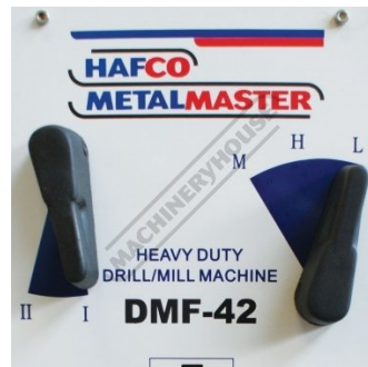
Gear Selection Levers