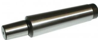
D4436 3MT x JT6 Drill Chuck Arbor - 1/2" BSW Threaded Shank