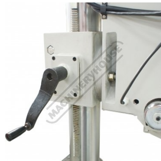
Rack and Pinion Wind Up Drill Head