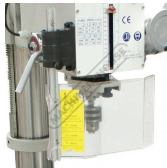
Swivel Safety Drilling Chuck Guard