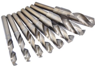
D1171 Metric Industrial HSS Reduced Shank Drill Set