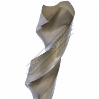
135 Degree Split Point M35 HSS 5% Cobalt