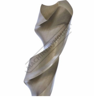
135 Degree Split Point M35 HSS 5% Cobalt