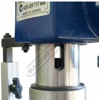
Drill Chuck Set Up For Removal