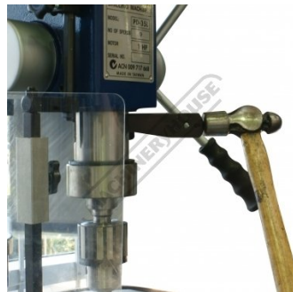
Drill Chuck Being Removed by Drill Drift