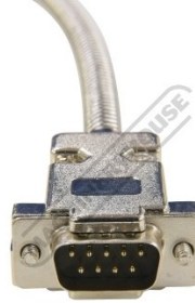
DSub9 Male Plug