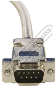
DSub9 Male Plug