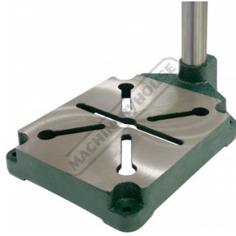
Cast Iron Base