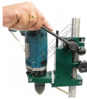
Spring Return Handle Mechanism Action (Hand Drill Not Included)