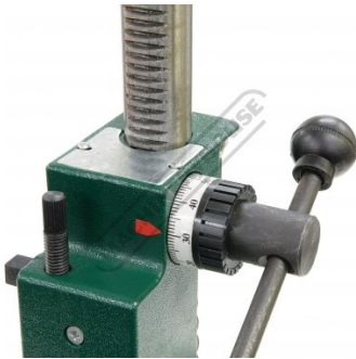
Rack and Pinion Quill Mechanism