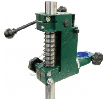
Head Rear View