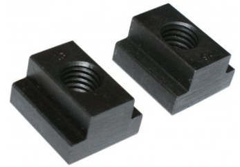
C086 Clamp Kit Tee Nuts