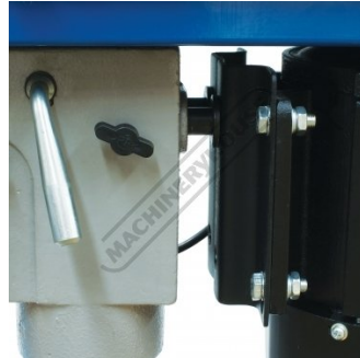
Belt Tension Lever and Lock