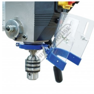
Safety Chuck Guard Flipped Up