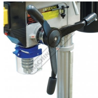
1 Piece Cast Iron Drilling Lever