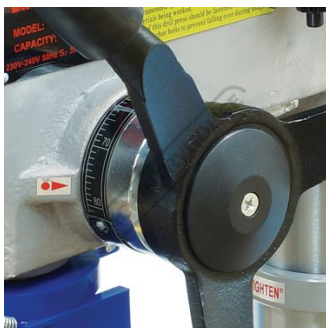
Drilling Depth Stop Setting With Scale