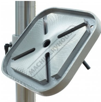
Tilting and Rotating Cast Iron Table