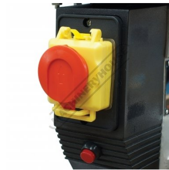
Emergency Stop Switch and Light Switch