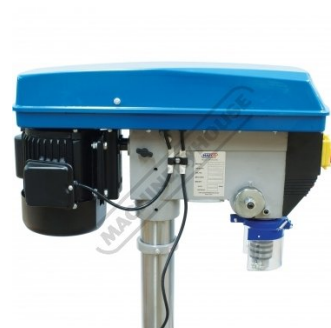
Head Side View