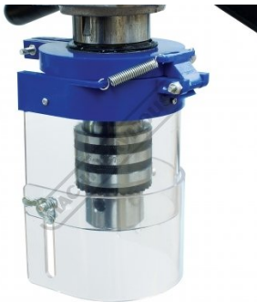
Adjustable Safety Chuck Guard with Flip Up Screen