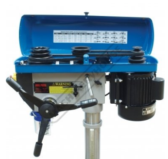
A Section Belt Drive System