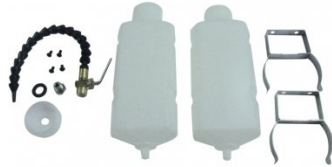
P220 Gravity Feed Coolant System