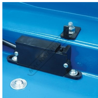
Safety Micro Switch on Pulley Guard