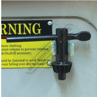
Chuck Key Holder