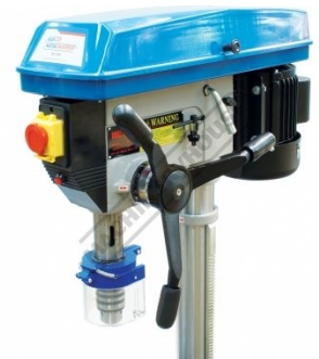
80mm Spindle Travel