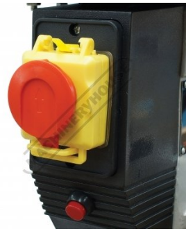
Emergency Stop Emergency Switch and Light Switch