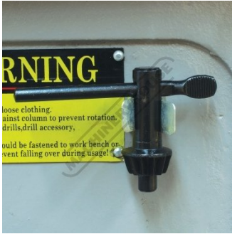
Chuck Key Holder