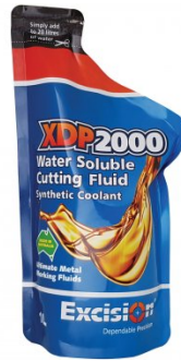
S090A Soluble Metal Cutting Fluid - 1 Litre