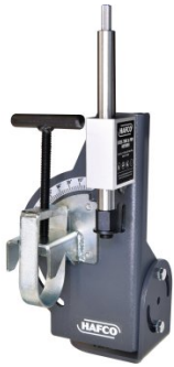
P090 Pipe & Tube Notcher Attachment