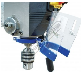
Safety Chuck Guard Flipped Up